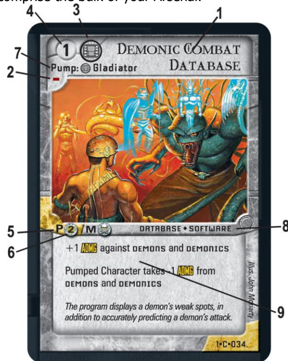
Figure 2 - Strategy Card

Strategy Cards work using the disciplines available to your Gladiators, giving them bonuses, minions, extra equipment, etc. They comprise the bulk of your Arsenal.