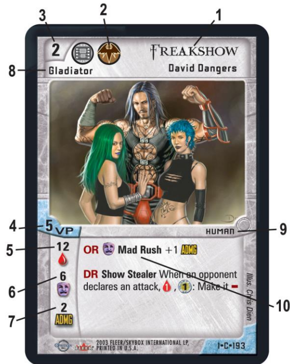
Figure 1 - Gladiator Card

In Ophidian, there are two main Card types: Gladiator Cards and Strategy Cards.